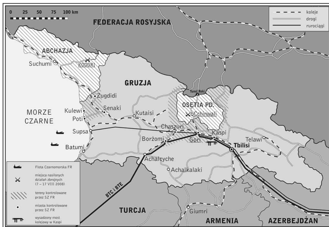
Figure 1. The main directions of Russian troops activities during the intervention against Georgia in 2008

Source: Międzynarodowe prawo humanitarne. Konflikt rosyjsko - gruziński w 2008 roku. Tom II, red. D. Bugajski